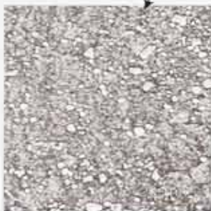
Metallographic picture of edge material (M42 HSS)

Wear comparison when cutting 400mm diameter, D2 material (with that of the conventional blade deemed as 100%)